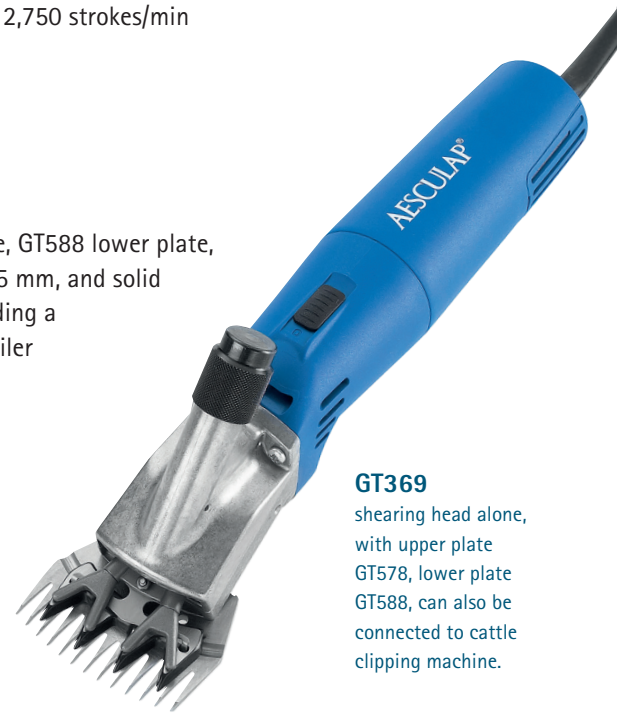
GT369 shearing head alone, with upper plate GT578, lower plate GT588, can also be connected to cattle clipping machine.